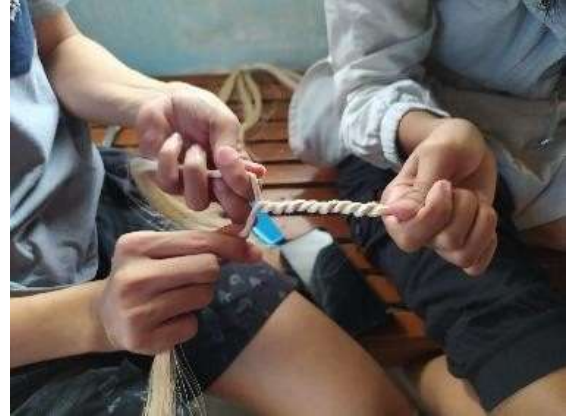
Fig. 5. Braiding of a single rope.

The collected banana pseudo-stems in Fig. 3 were cleaned up to remove impurities before the extraction process. Banana Pseudo-Stem Fibers (BPSF) were separated from the stems by a water retting process, soaking it within a 24-hour duration. In Fig. 4, the fibers were extracted by scraping the soaked BPSF with a scraper tool to remove the remaining lignin and hemicellulose. Then, the fibers were collected and air-dried until the free water content was removed.