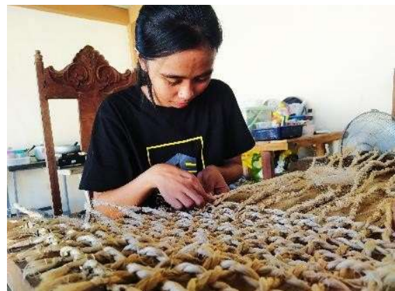
Fig. 6. The weaving of ropes.

After extracting the BPSF, a single rope was manually fabricated. Fig. 5 shows a single rope made by braiding two even lengths and sections of BPSF in the same direction. As the rope's tip approached, another pair of BPSF was joined to overlap the previous pair's tails and secure the connection between the ropes. This step was repeated until the desired length was achieved. After that, the BafNet was woven in the traditional open-weave design in Fig. 6 by intertwining the single rope at right angles to each other.