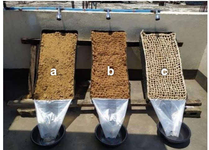
Fig. 14. Experimental Test Beds: (a) Bare Soil (b) with Coconet (c) with BafNet.

The measured time it took for the showerhead to fill up a 95 mm container with water was used to calculate the average rainfall intensity used in the soil run-off simulation. Fig. 13 shows five trials for each of the three showerheads. A surface run-off test was conducted on a soil testbed with a 30° slope to simulate a run-off scenario using water as the primary agent of weathering and erosion [17]. Three soil testbeds with 865mm (l) x 445mm (w) dimensions were created. In Fig. 14, soil bed A was the bare soil, soil bed B was the soil with Coconet, and soil bed C was the soil with BafNet. For the erosion control test, an artificial rainfall which was water coming from three showerheads (one for each soil testbed), was installed 1 foot above and perpendicular to the top of the soil testbed. For 25 minutes, the rainfall intensity remained constant.