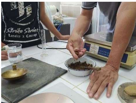
Fig. 8. Liquid and Plastic Limit Test.

Another test conducted for the soil samples focused on the Liquid Limit and Plastic Limit as defined in ASTM Standard D 4318. The moisture content required to close a distance of 12.7 mm along the bottom of the groove after 25 blows is the Liquid Limit. On the other hand, the moisture content at which the soil crumbles when rolled into 3.0 mm threads is known as Plastic Limit. Soil with a smaller diameter breaks due to wet soil, while a larger diameter soil breaks due to dry content. Fig. 8 shows the materials needed in this procedure.