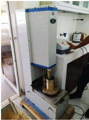
Fig. 7. Mechanical Compactor.

Another test conducted for the soil samples focused on the Liquid Limit and Plastic Limit as defined in ASTM Standard D 4318. The moisture content required to close a distance of 12.7 mm along the bottom of the groove after 25 blows is the Liquid Limit. On the other hand, the moisture content at which the soil crumbles when rolled into 3.0 mm threads is known as Plastic Limit. Soil with a smaller diameter breaks due to wet soil, while a larger diameter soil breaks due to dry content. Fig. 8 shows the materials needed in this procedure.