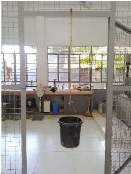
Fig. 12. A BPSF rope carrying a bucket.