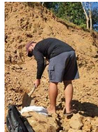
Fig. 1. Accumulation of Soil Samples.

The soil samples in Fig. 1 were acquired from an identified eroded area in Sitio Tueg, Bitag Grande, Baggao, Cagayan as per the Mines and Geo-Sciences Bureau (MGB) Rapid Geohazard Assessment last 2017 (Appendix A). After that, a request letter was prepared for soil testing at the Department of Public Works and Highways (DPHW) Laboratory and Testing Office.