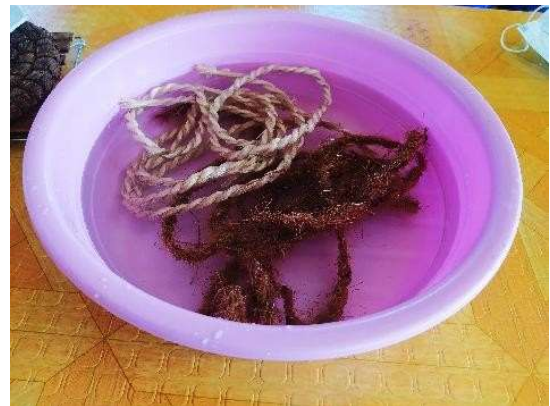
Fig. 10. BSPF ropes and coco fiber ropes soaked in water for 24 hours.