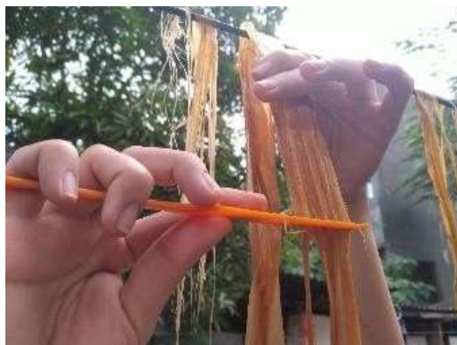
Fig. 4. Fiber Extraction.

The collected banana pseudo-stems in Fig. 3 were cleaned up to remove impurities before the extraction process. Banana Pseudo-Stem Fibers (BPSF) were separated from the stems by a water retting process, soaking it within a 24-hour duration. In Fig. 4, the fibers were extracted by scraping the soaked BPSF with a scraper tool to remove the remaining lignin and hemicellulose. Then, the fibers were collected and air-dried until the free water content was removed.