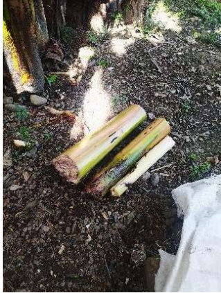
Fig. 2. Collection and preparation of Banana Pseudo-Stems.

The banana plantation was visited in Rizal, Cagayan, to ask permission from the owner to get some of the banana (Saba) trees that have been harvested. It was cut into one-meter lengths and transported to Tuguegarao City for preparation in Fig. 2. This process helped the owner reduce the agro-waste by converting it into more useful materials such as the net.