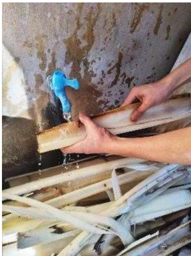
Fig. 3. Removing the impurities.