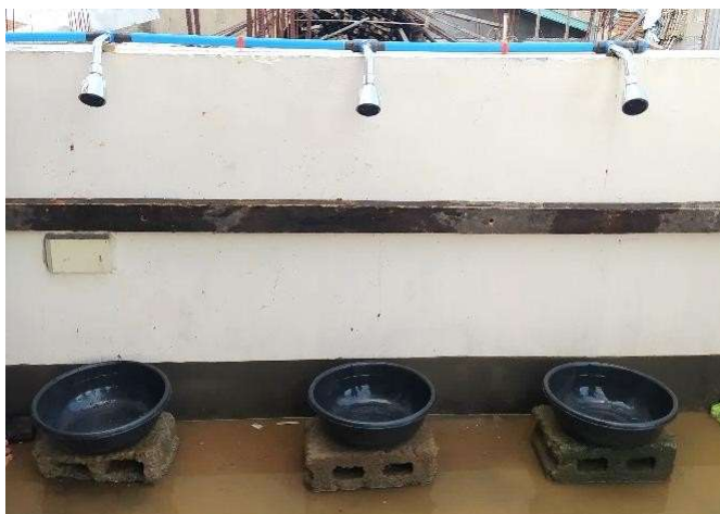
Fig. 13. Showerheads and basins for rainfall intensity.

The measured time it took for the showerhead to fill up a 95 mm container with water was used to calculate the average rainfall intensity used in the soil run-off simulation. Fig. 13 shows five trials for each of the three showerheads. A surface run-off test was conducted on a soil testbed with a 30° slope to simulate a run-off scenario using water as the primary agent of weathering and erosion [17]. Three soil testbeds with 865mm (l) x 445mm (w) dimensions were created. In Fig. 14, soil bed A was the bare soil, soil bed B was the soil with Coconet, and soil bed C was the soil with BafNet. For the erosion control test, an artificial rainfall which was water coming from three showerheads (one for each soil testbed), was installed 1 foot above and perpendicular to the top of the soil testbed. For 25 minutes, the rainfall intensity remained constant.