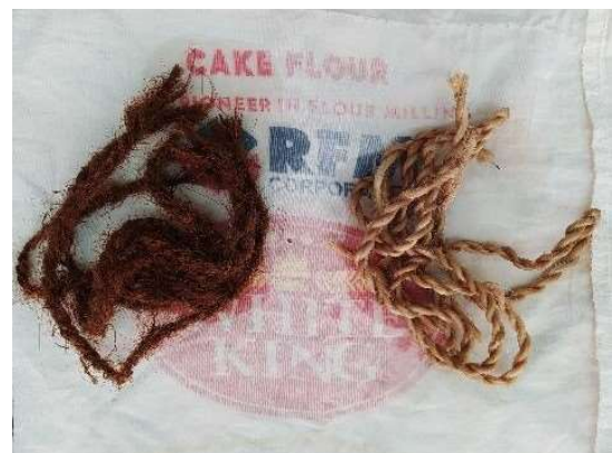
Fig. 11. BSPF ropes and coco fiber ropes are pat-dried with a clean cloth.