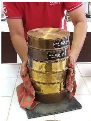
Fig. 9. Sieve Analysis.

The method described in ASTM C 136 and AASHTO T 27 covers the quantitative determination of the distribution particle